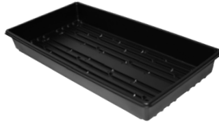
710247C 1020 Heavy Weight