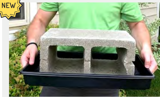
710254C 1020 XXX Heavy Weight