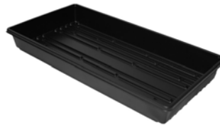
710249C 1020 XX Heavy Weight