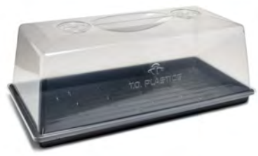
745730C w/dome FLAT-GERM-TRAY