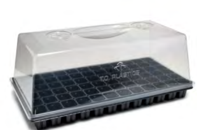
720469C w/dome PL-72-SQ-NET-VH