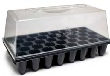
720578C w/dome PL-38-STAR-4.0-NV