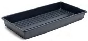
FLAT 710251C STF-1020-OPEN-NH