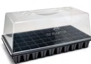
720695C w/dome PL-SR-50-3-VH