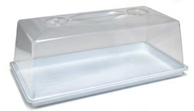
760247C w/dome FLAT-DISPLAY-WH-NH