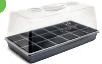
DOME 760525C STF-1020-DOME-TALL-CL