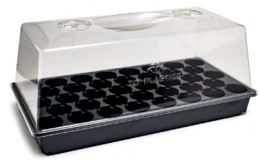
725601C w/1020 flat + dome PROP-38-RD-NV