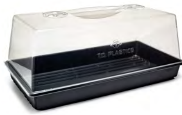
710251C w/dome STF-1020-OPEN-NH