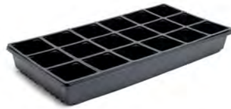
INSERT 715385C STI-1801