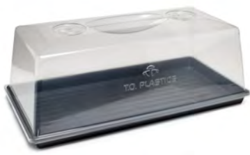
745731C w/dome FLAT-GERM-TRAY-NH