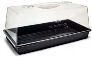
710245C w/dome STF-1020-OPEN